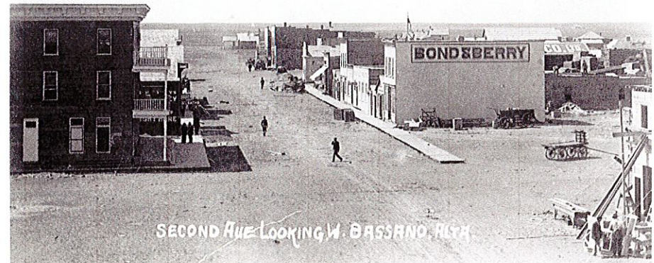
Main Street looking west