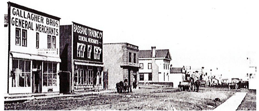
Main Street looking east