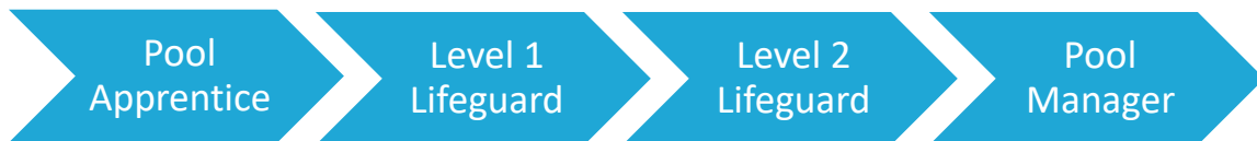
Image 2: Lifeguarding Staff Flow Chart

To encourage current staff to continue to grow within the organization and to attract new staff the Town will implement employee advancement techniques, a tool used to demonstrate progression from one position to the next. Individuals can visually see the responsibilities and opportunities of each position and steps required for advancement (see to Appendix A).