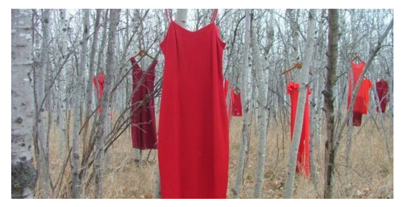
<u> Mental Health Awareness Week – "Let's Connect" – May 15-21, 2023</u>

Mental health awareness now highly prioritized. Upper levels of government, communities, nonprofit, and industry participates to offer mental health supports for people. As the social service provider, it is important to FCSS to do the same – we are the conduit or the connectors in the community. The theme for Mental health week 2023 is "Let's Connect".