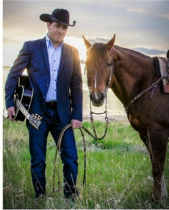
An acoustic, intimate evening with one of our all-time favourites, George Canyon! November 8 th , 2023

Season Tickets for this year's season are on sale now! Four concerts for $70 – at the Town of Bassano Office, the Brooks ConnectFirst Credit Union or by sending an email then an etransfer to bassanoac@gmail.com !!