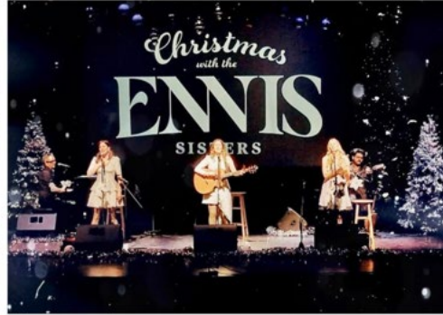
From Newfoundland – the Ennis Sisters! November 27 th , 2023