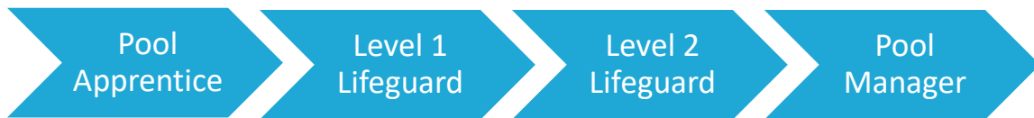
Image 2: Lifeguarding Staff Flow Chart

To encourage current staff to continue to grow within the organization and to attract new staff the Town will implement employee advancement techniques, a tool used to demonstrate progression from one position to the next. Individuals can visually see the responsibilities and opportunities of each position and steps required for advancement (see to Appendix A).