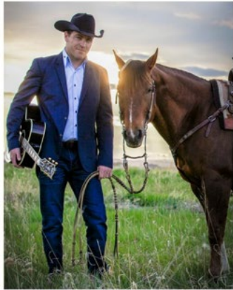
An acoustic, intimate evening with one of our all-time favourites, George Canyon! November 8 th , 2023

Season Tickets for this year's season are on sale now! Four concerts for $70 – at the Town of Bassano Office, the Brooks ConnectFirst Credit Union or by sending an email then an etransfer to bassanoac@gmail.com !!